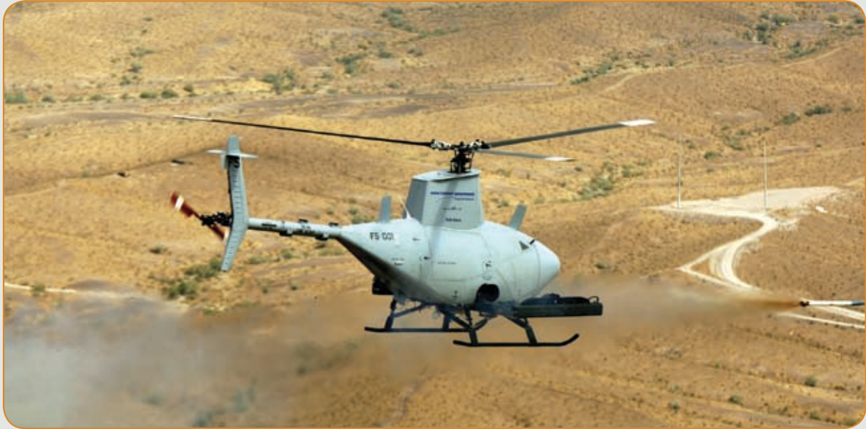
Arete Associates, Daniel H. Wagner Associates, Torch Technologies, Pacific Advanced Technology and Epitaxial Technologies, LLC are Navy SBIR companies that have contributed technologies to Northrop Grumman's Fire Scout shown here.

Northrop Grumman Corporation , a leading global security company, provides innovative systems, products and solutions in aerospace, electronics, information systems, shipbuilding and technical services to government and commercial customers worldwide.