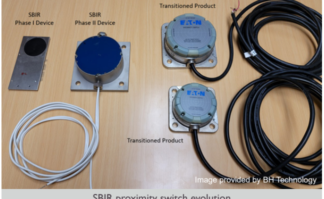
SBIR proximity switch evolution

The Sensors group in Eaton's Industrial Controls Division has designed and manufactured sensors and limit switches to the requirements of a range of industrial customers and Navy shipboard applications for many decades. Resistance of electronic sensors in the Eaton portfolio to sources of electrical and electronic "noise" in an application environment is an important operating characteristic, and noise immunity requirements in many industrial environments fall in the range of three to 20 volts per meter. Some application environments in Eaton's target markets, including mining, mobile agricultural and construction vehicles,