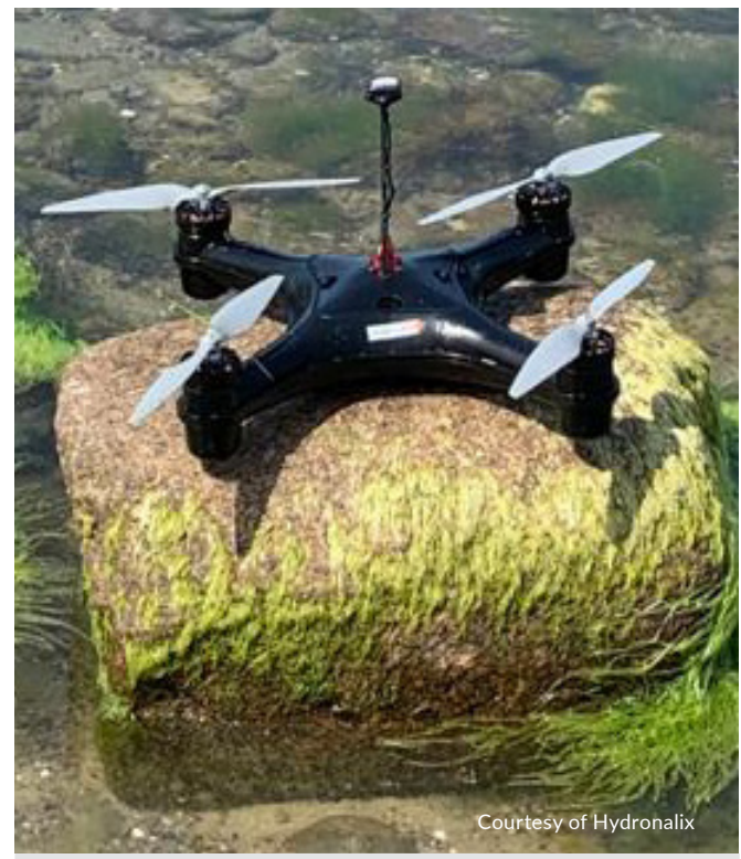
The ADAPT disposable drone can deliver a payload to an exact location up to a mile and a half away.

Of particular interest and focus to the USMC was the AMY unmanned surface vehicle (USV). AMY can carry a variety of payloads and utilized a commercial-off-the-shelf (COTS) sonar unit produced by Hummingbird during the event. Other Hydronalix initiatives used in