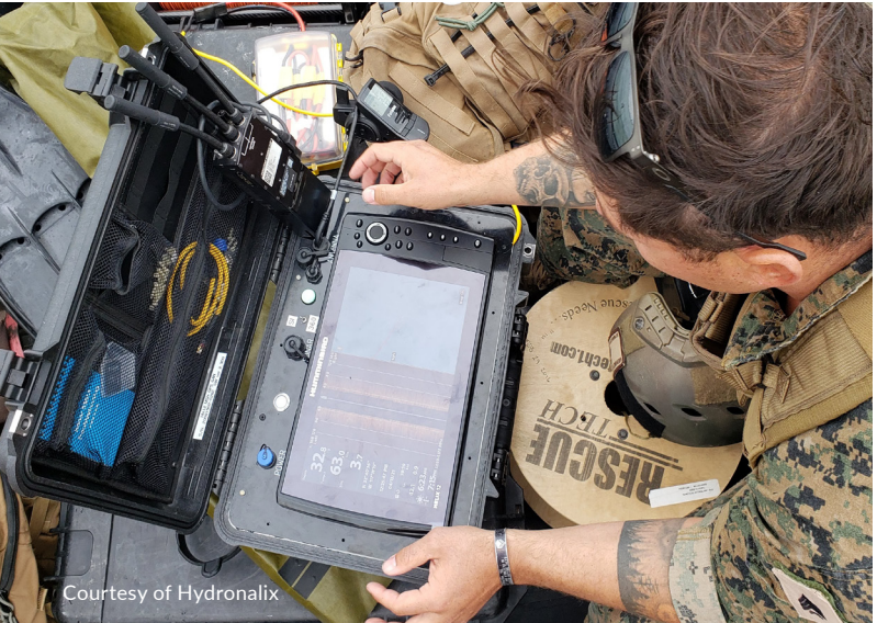
The AMY USV can carry a variety of payloads and utilized a commercial-off-the-shelf sonar unit produced by Hummingbird during BALTOPS.

take information. whether it be from another team out on the water or divers from under the water or our unmanned system, and pump it up and out SATCOM in order to have real time data imagery video anywhere in the world. Hydronalix took a step toward that in the RF world. Data was pushed all the